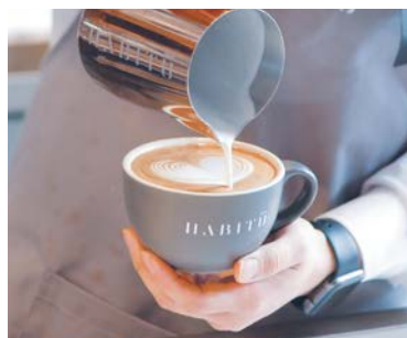
H HABITŪ Favourites