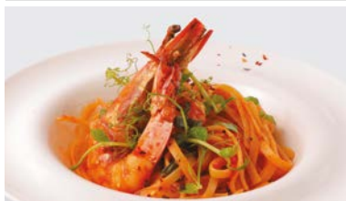
TIGER PRAWN LINGUINE 188 grilled tiger prawn, shrimps linguine, basil ripe tomatoes, Italian parsley, dash of chili flakes 香草大蝦扁意粉