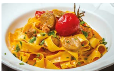
H SAUSAGE PAPPARDELLE 158 fresh pappardelle, cumberland sausage ragu, vine-ripened tomatoes cream 蕃茄肉腸寬麵