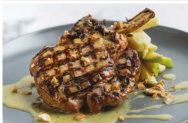
H CANADIAN PORK RACK 198 jicama and rainbow radish salad, green apple, dijon vinaigrette 香烤厚切豬鞍扒