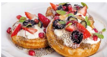
MIXED BERRIES PANCAKES 88 greek yogurt, chia seed, honey 野莓班戟