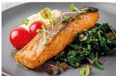
H SEARED SALMON STEAK, 188 garlic sautéed spinach, mashed sweet potato, honey ponzu 脆皮三文魚扒