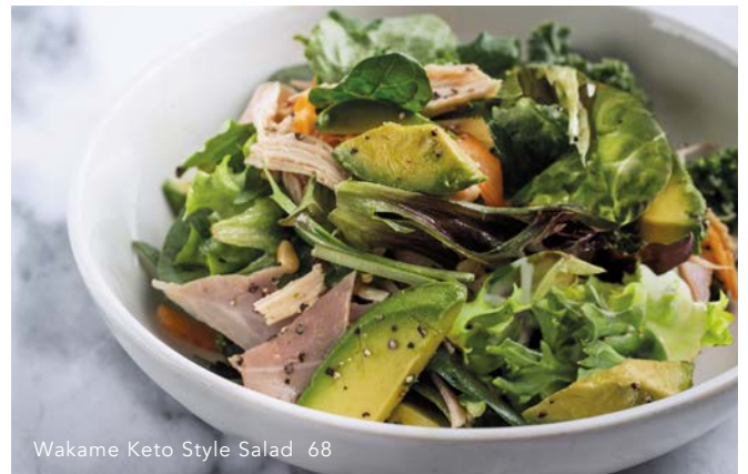
Wakame Keto Style Salad 68