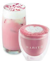
H Beetroot Soy Latte good source of immune booster 紅菜頭泡沫豆奶 HOT 54 / ICED 56