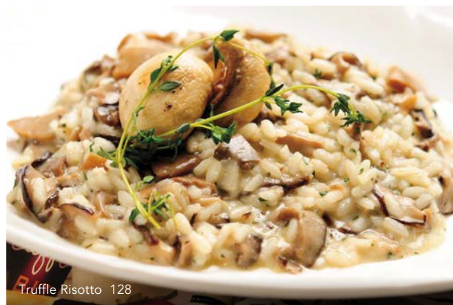
Truffle Risotto 128

fresh wild mushrooms, Italian short grain rice, aged parmesan, truffle paste and oil 雜菌意大利飯