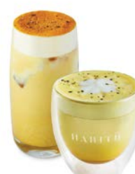
Turmeric Soy Latte a natural remedy for flu 薑黃泡沫豆奶 HOT 54 / ICED 56

Iced Wellness Soy Latte is topped with Vegan Tofu Cream