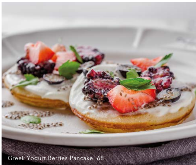
Greek Yogurt Berries Pancake 68

hot fluffy pancake, honey, chia seed, Greek yogurt, fresh strawberries, blueberries, blackberries 野莓班戟