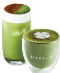
Matcha Soy Latte high in antioxidants 抹茶泡沫豆奶 HOT 54 / ICED 56