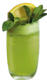
Garden Lemonade fresh garden herbs, mint leaves and lemon slice 檸檬汁、新鮮田園香草、 薄荷葉及檸檬 ICED 54