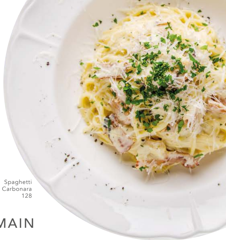
Spaghetti Carbonara 128