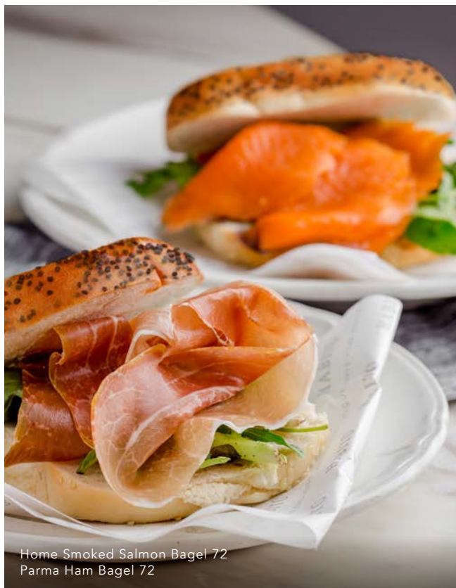
Home Smoked Salmon Bagel 72 Parma Ham Bagel 72